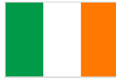
Government of Ireland