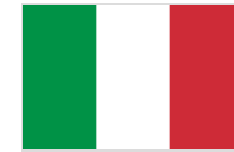
Government of Italy