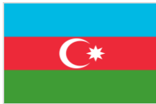
Government of Azerbaijan