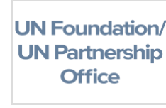
UN Foundation/ UN Partnership Office