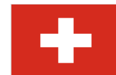
Government of Switzerland