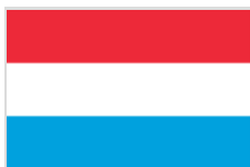
Government of Luxembourg