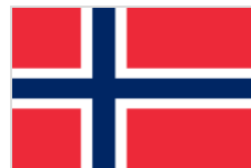
Government of Norway