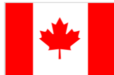
Government of Canada