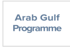
Arab Gulf Program for Development