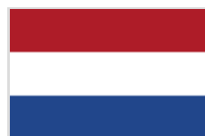
Government of Netherlands