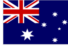
Government of Australia