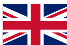
Government of the United Kingdom