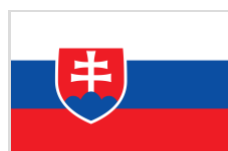
Government of Slovakia