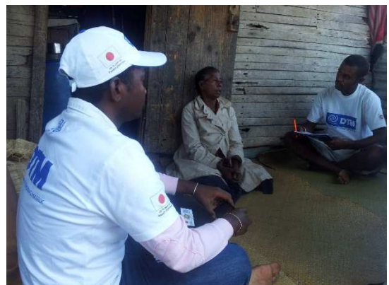
Household DTM survey, site assessment in Bekily district, November 2017.