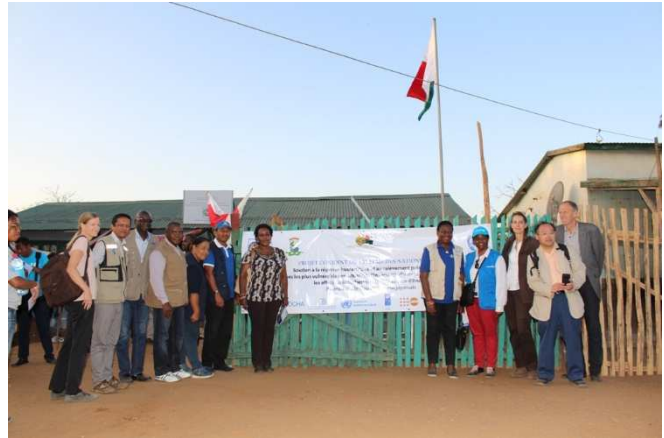
First joint monitoring visit, August 2017 Location: local coordination office in Ambovombe

A first monitoring visit was conducted in August 2017 jointly by the UN Resident Coordinator, the Japan Embassy Advisor and the Chief of National Disaster and Risk Management Office, with the participation of Heads of UN Agencies and other donor (Norway) involved in humanitarian interventions in the “Grand Sud”. This visit aimed to appreciate the initial achievement of the joint project, discuss with the community beneficiaries of the joint project and collect their point of views, and finally raise the visibility of the joint-project both at the national and local levels.