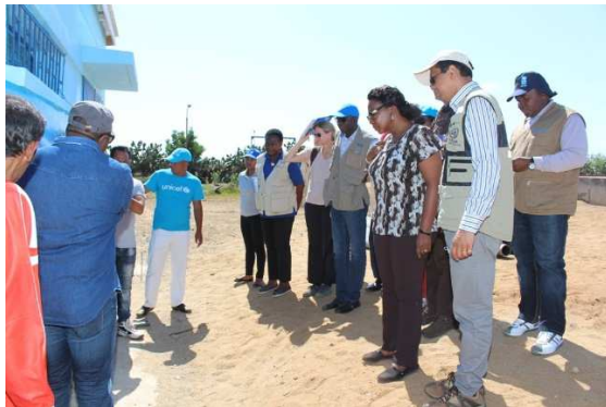
First high level of joint monitoring visit, August 2017, Androy region OCHA