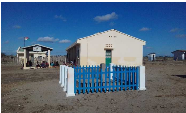
Water point (fountain) in Nikoly village, middle water supply and ramification to Sampona pipeline, Tsihombe district.