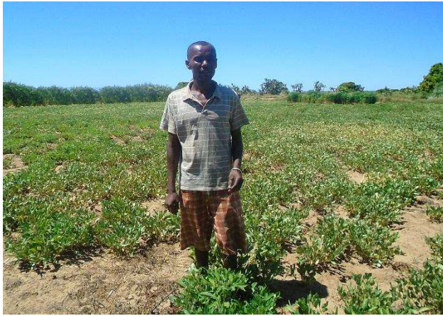
Agriculture diversification : peanut farming in Antalatanosy commune, Ambovombe district. FAO