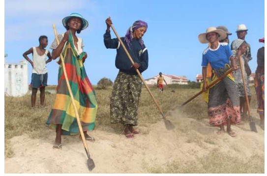
Women head of households, specific target of "Income Generating Activities", Ambovombe. UNDP