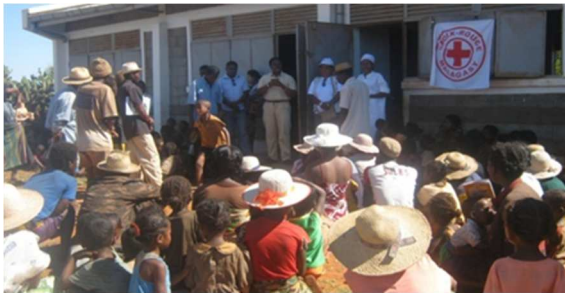
Health mobile team, Androdroho.