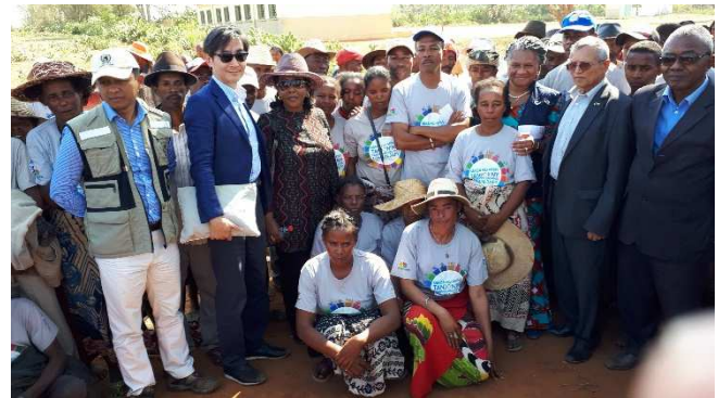
Final joint monitoring visit, August 2018 Location: visit of the rehabilitated road between Ambonaivo and xxx, discussion with the women beneficiaries

Finally, in August 2018 (one month prior to the project end-date), a second high level of strategic monitoring visit was conducted by the UN Resident Coordinator, the Japan Ambassador, all UN Head of Agencies, and Representative of the National Disaster and Risk Management Office.