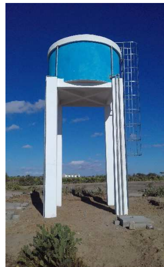
Water Tank IN Nikoly village, middle water supply and ramification to Sampona pipeline, Tsihombe district.