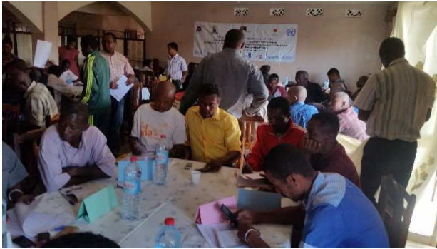
Local workshop to update baseline and identify early warning indicators, Ambovombe WFP/OCHA