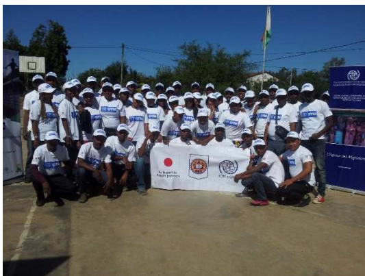
Training of DTM enumerators and supervisors with IOM and BNGRC teams, Ambovombe district, August 2017