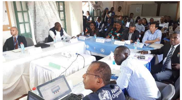
Final high level of joint monitoring visit, August 2018, Presentation of the key achievements of the project, Local coordination office, Ambovombe. OCHA