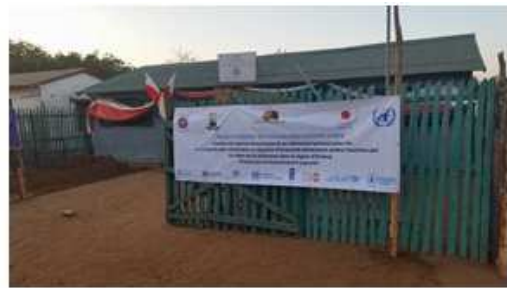
Projet conjoint du SNU. Présentation des travaux d'extension du bureau local de coordination et du premier bulletin de la Matrice de Suivi des Déplacements (DTM)/OIM.

Le BNGRC hébergera les deux systèmes (DTM et SAP) et un travaux d'extension de son bureau local à Ambovombe a été ainsi prévu pour accueillir les ressources nécessaires.