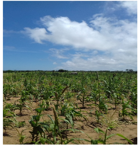
Agriculture diversification: sorghum in Marovato commune, Tsihombe district.