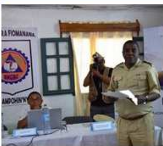
M. Mosa Romain, Préfet Androy lors de la présentation des leçons apprises post El Nino

Dans la continuité des leçons apprises, la mise en oeuvre du Plan de relèvement et de résilience (PRR) constitue une priorité. Ce plan vise à maximiser les efforts humanitaires mis en place depuis la crise, mais surtout à s'attaquer aux causes structurelles de la vulnérabilité des populations et des institutions. Parmi ces causes figurent la difficulté d'accès à l'eau, les systèmes agricoles défaillants, les faibles opportunités d'emploi, la dégradation de l'environnement, le mauvais état des routes, le manque de capacités des collectivités locales décentralisées.