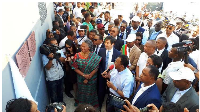
Final joint monitoring visit, August 2018 Location: Inauguration of the health productive equipment donated to the CHRR Androy,

This last visit was jointly conducted by the Government, especially with the Minister of Economy and Planning. The main objective is to have a clear view of the final achievements of the project, exchange on lessons learned with local Authorities, direct beneficiaries and implementing partners. This last high level of visit was simultaneously an opportunity to inaugurate some key achievements of the project in the presence of the President of the Republic and the UNFPA Regional Director for Southern Africa during the celebration of Young International Day.