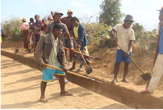
Rehabilitation of rural road, Ambovombe. UNDP