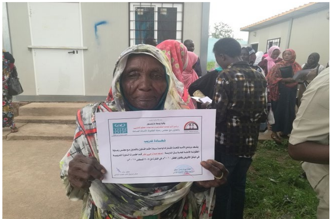
Hakama (Traditional Community Singer) at the age of 65 is proud of her participation certificate in child protection workshop, Zalingie Police HQ hall - 16 August 2018