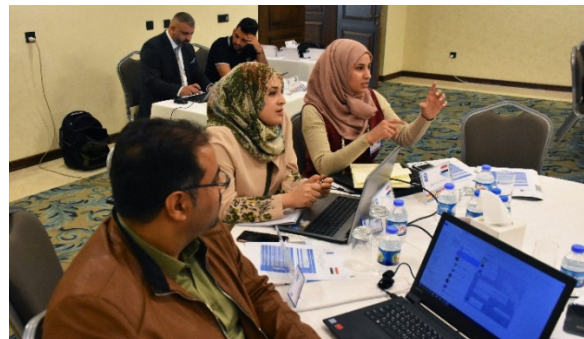
Description: Participants from the University of Karbala at a Workshop on the e-learning system

Already in 2018 85% of the activities were by UNICEF, UNESCO, WHO and UN-Habitat. In 2019 activities were only undertaken by WHO. Overall the output focuses on reforms in education,