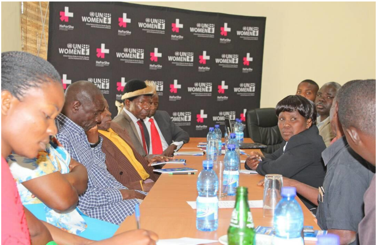
Chiefs meetings on gender responsive bylaws that promote girl's education- Dedza and Mangochi Chiefs: Courtesy of Limbani Msiska- UN Women, 2017

A key outcome of the meetings was that action plans were developed and participants agreed to implement several strategies to contribute towards achieving the project specific outcomes of improving the retention of girls in primary school and to address challenges that keep girls out of school.