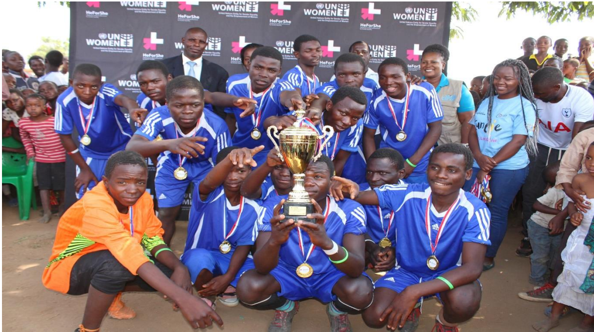
Group photo – The Chimbiya primary school football team with their branded JPGE HeForShe trophy and medals. - Dedza, 2017: Courtesy of Lusungu Jonazi- UN Women, 2017

Another innovative engagement was UNICEF's partnership with Standard Bank. Through this partnership, Standard Bank mentored 100 girls from school around Chimbiya Zone. A mid-year review of the initiative indicated that the mentorship had achieved the desired result among girls as now they were more motivated to remain in school and they aspire to be like the mentors they have engaged with. Apart from the sessions, Standard Bank also provided exposure to girls by giving them educational visits to Lilongwe.