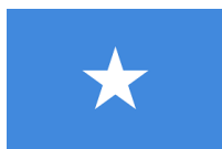
Government of SOMALIA