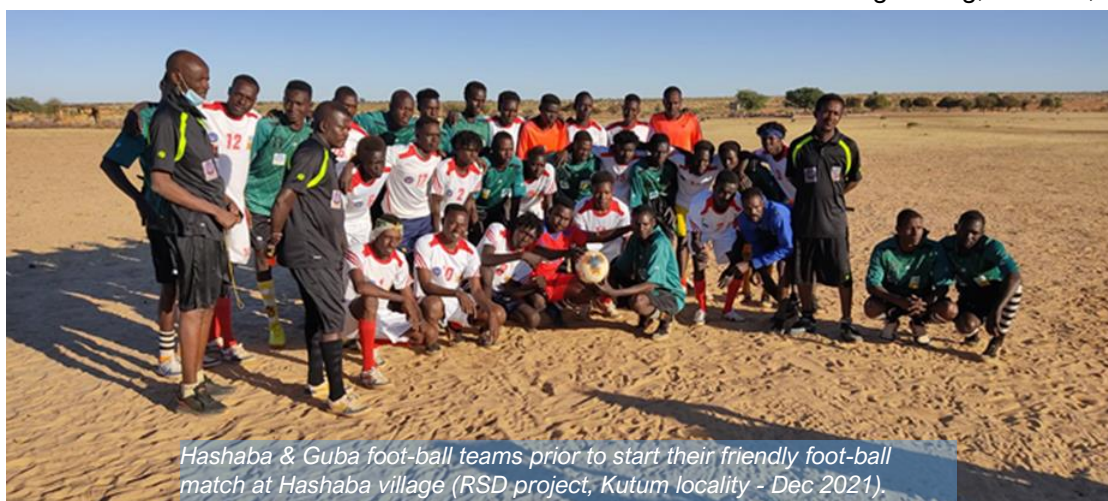
Hashaba & Guba foot-ball teams prior to start their friendly foot-ball match at Hashaba village (RSD project, Kutum locality - Dec 2021).

Two cultural events were organised by DCPSF implementing partners in partnership with local authorities, CBRMs and local leaders. In East Darfur, the event showcasing music, food and organised by Alight also attracted neighbours from South Darfur. The event was crowned with football matches from the 8 teams in the 4 administration units of Al Firdous locality. In North Darfur, DCPSF Partner WHH organised an event promoting social cohesion through song, folklore, and