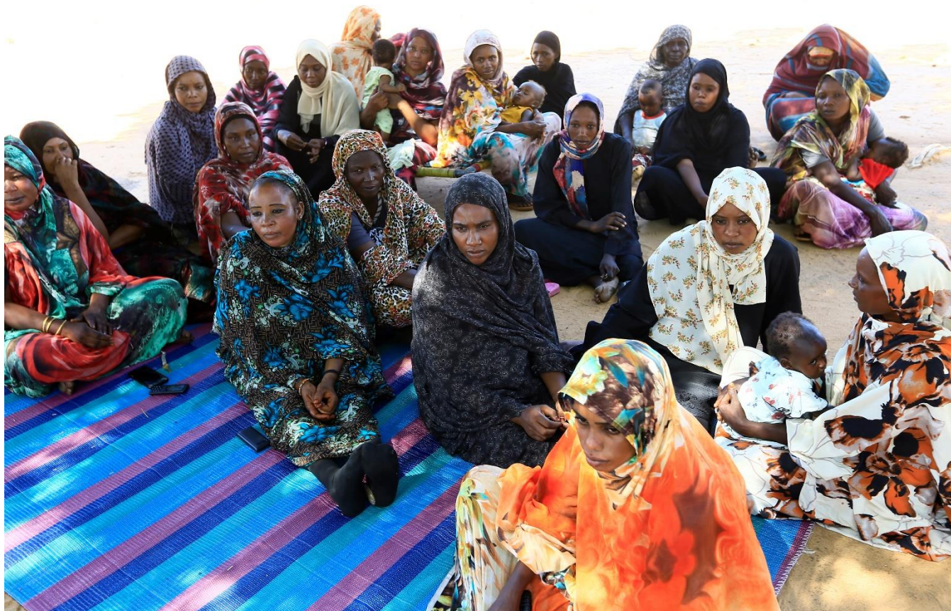
Women in El Galabi village attend a GaPI meeting.