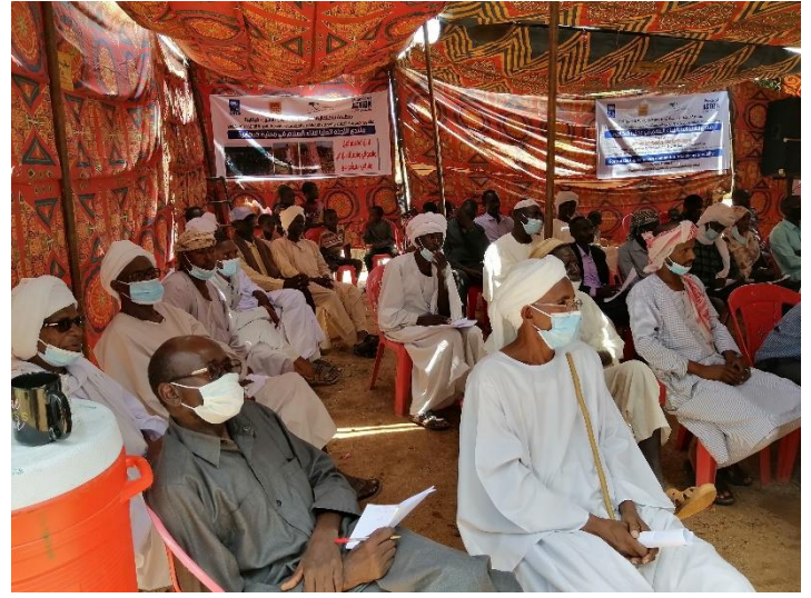
CBRM members and other members of the community attend a higher peace forum in Kabkabiya - North Darfur.