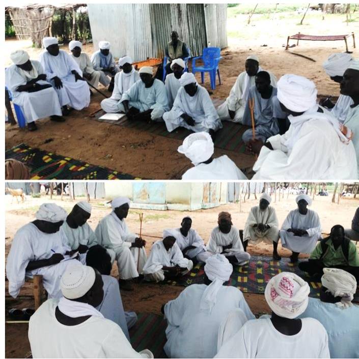
Members of the impartial panel discussing the animal theft cases between the Habania and Riseigat tribes that had paralysed commerce and livelihoods between Al Firdous locality in East Darfur and Al Sunta locality in South Darfur. The panel organised by Alight and CBRM members was able to resolve the conflict to the satisfaction of all parties involved.

Steps were taken to minimize potential distractions and encourage constructive dialogue between the involved parties. These included removing individuals who were not a party to the original dispute. Following the tribal customs for negotiating disputes and customary guidelines for compensating injured parties, the two sides presented their cases to the impartial panel. The panel discussed it and shared its decision, including payments to affected persons. The agreement was accepted by all parties, ending eight months of tension that negatively affected social and economic activities for the people. The community led mediation and solution helped avoid an even more destructive conflict and promoted peace in the communities – the primary goal of the DCPSF projects.