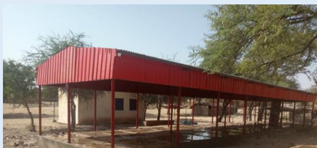
Figure 1: The just completed market shelter in Sirba locality, West Darfur (Photo credit: Concern Worldwide 2021).

Before rehabilitation of Sirba market shelter, fruits and vegetables were displayed on the ground and were often contaminated and not entirely safe for eating. With the new shelter, fruit and vegetable vendors are happy to sell cleaner produce to their customers from the community.