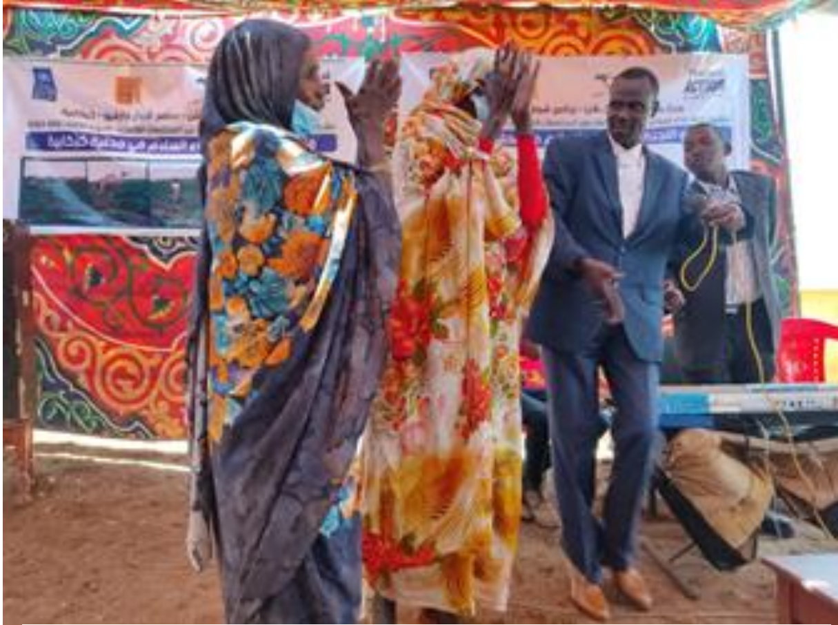
Hakamat women singing a peace song during a higher peace forum gathering in Kebkabiya, North Darfur.