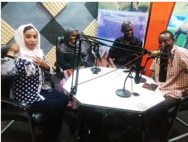
Participants in a radio programme in East Darfur.