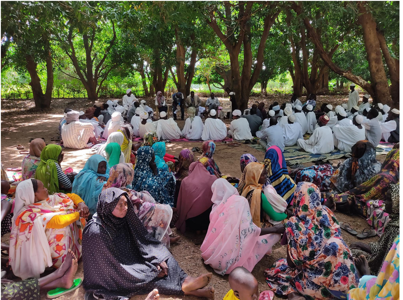
A community meeting in Waru village, in Wadi Salih locality of Central Darfur State to select CBRM members