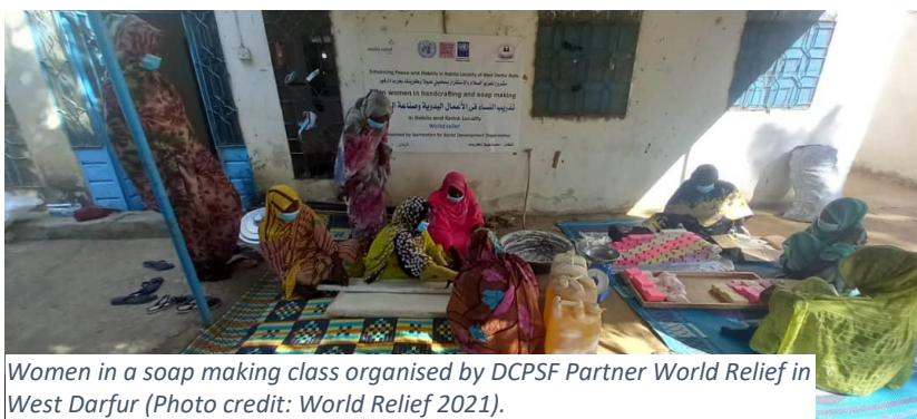
Women in a soap making class organised by DCPSF Partner World Relief in West Darfur.

up in activities, particularly those on savings and business skills building which enable them to provide an extra source of income for their families. In East Darfur for example, the seven CBRMs formed by DCPSF partner DDRA all agreed to have women as deputy chairs.