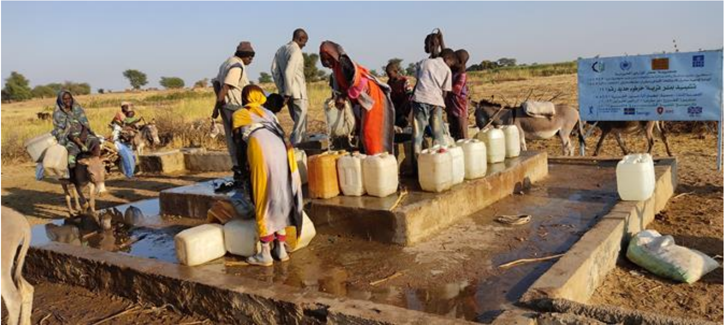
A newly constructed hand-dug well, at Khartoum Jadeed village in Sarafohra locality in North Darfur. (KSCS project 2021)