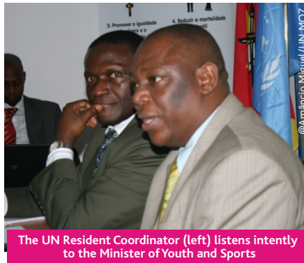
The UN Resident Coordinator (left) listens intently to the Minister of Youth and Sports

The two delegations established technical working teams to ensure that the outlined priorities are reflected in the UNDAF under development as well as the short term support for activities that must be implemented immediately to meet the aspirations of the Mozambican young people.