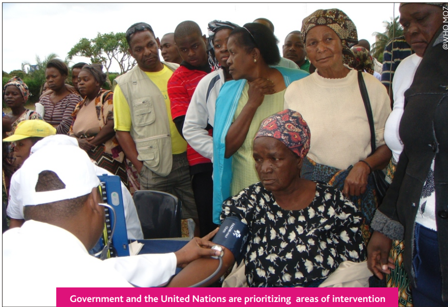
Government and the United Nations are prioritizing areas of intervention

Specifically, the participants were expected to reach an understanding on the following: 1) the country's development priorities as reflected in the PQG, 2) UN in Mozambique comparative advantages to be able to address the identified national priorities and 3) the proposed steps for the drafting of the new UNDAF.